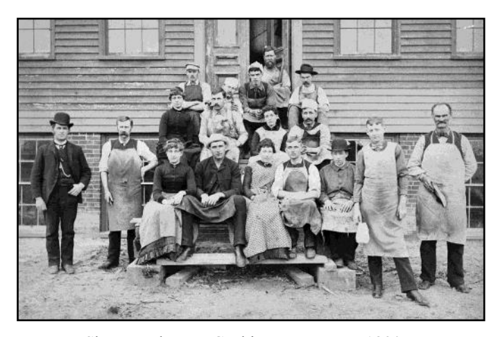
Shoe Workers at Cushing Factory, ca 1890s

Shaw and Cumberland Shoe put Cushing and a number of other smaller shoe shops out of business. Manufacturing at the Cushing building was revived in 1927 by the Small-Abbott Shoe Company, who made moccasins for the next 3 decades.