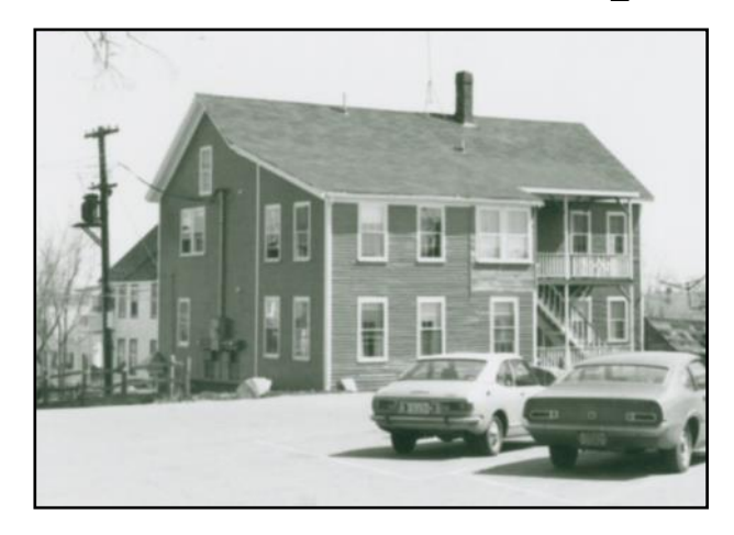
Cushing Factory Building, ca 1970