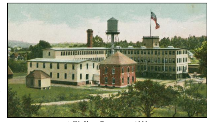
A.W. Shaw Factory, ca 1900

Shoemaking was important industry Freeport for more than a hundred years beginning with the Davis Brothfactory on Beech ers' Hill Road in 1872, and ending with the final pair of shoes manufactured in town by Eastland Shoe in 2001. Our new major exhibit will describe the history of shoemaking in Freeport—from the itinerant cobblers who constructed custom-made