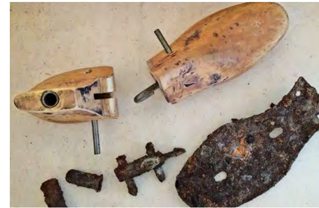
Shoe last parts (metal) and a dismantled last showing internal parts.