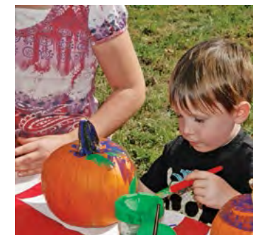
Pumpkin painting for all ages.