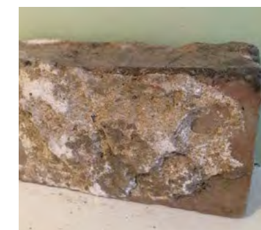
The 18th century dwelling house brick.