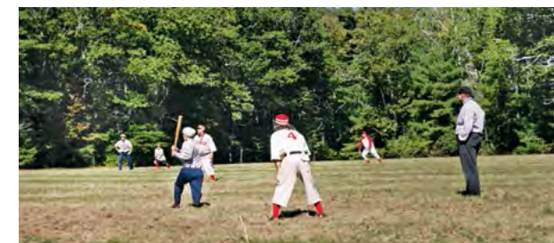
The Vintage Baseball Teams of Dirigo from Maine and visitors from Ipswich, Massachusetts were playing in the north pasture and lead an instructional session between two games.