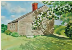
Exhibit Opening: Historic Freeport Artwork