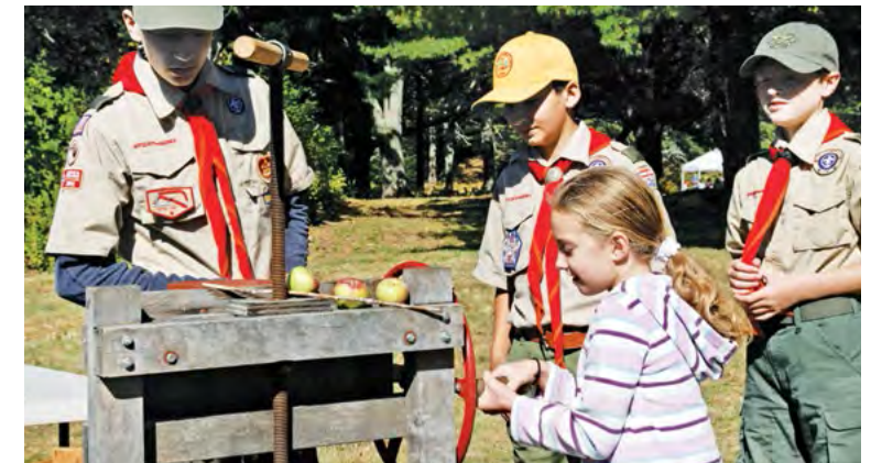
Freeport Boy Scout Troup 45 was on hand to grind and squeeze apples for all takers, young and old.