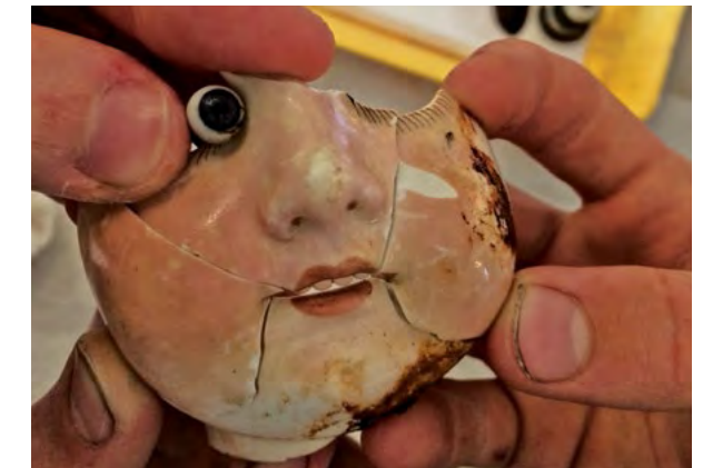
19th Century porcelain doll face.