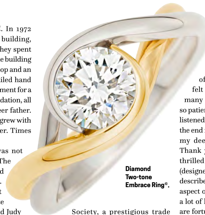
Diamond Two-tone Embrace Ring®.