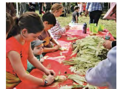
Corn husk doll making with the Bath Savings Bank team.

We wish to thank our Corporate Sponsors for this event which help us cover the costs of the event and contribute to our annual operating costs.