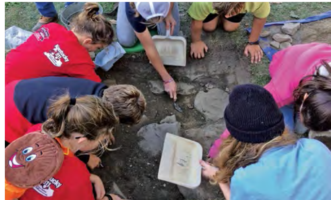
Community members digging in a test pit.