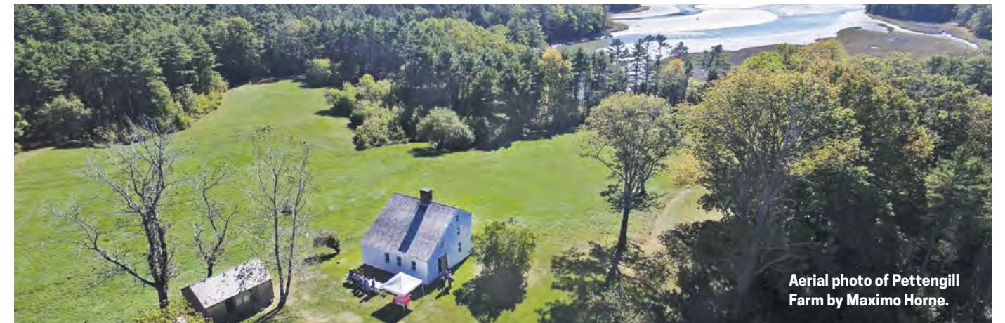
Aerial photo of Pettengill Farm.

The sun was out and so were about 400 friends of our wonderfully preserved and authentic Salt Water Farm. There were horse drawn wagon rides, tours of the original farm house, strolling minstrels, craft tables and fresh S'mores being cooked throughout the day. The cook tent was staffed by a lively crew of volunteers pushing Moxie and Eli's Root Beer.