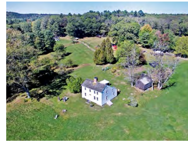
Eagle's view of the farmhouse.